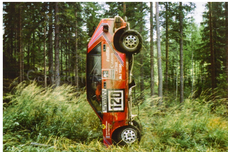
Reijo Keskikiikonen: Tommi TN 2016:4